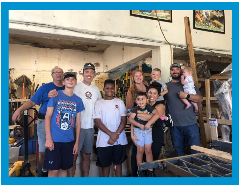
Families spending time together volunteering!

https://www.signupgenius.com/go/20f0a48a4aa2da2f58-tools1#/