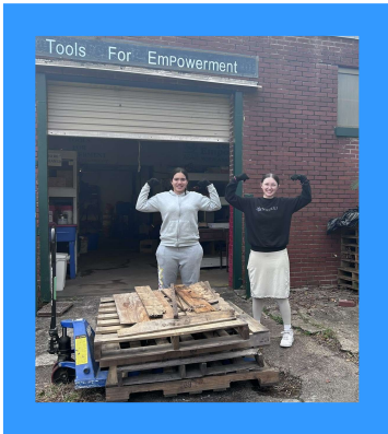
Volunteers from Northgate High School get the job done!

As the nights have grown longer, winter gives us time to slow down and enjoy being together. During this season, our community has shown remarkable unity and generosity, working hand in hand to bring hope and light to families in need.