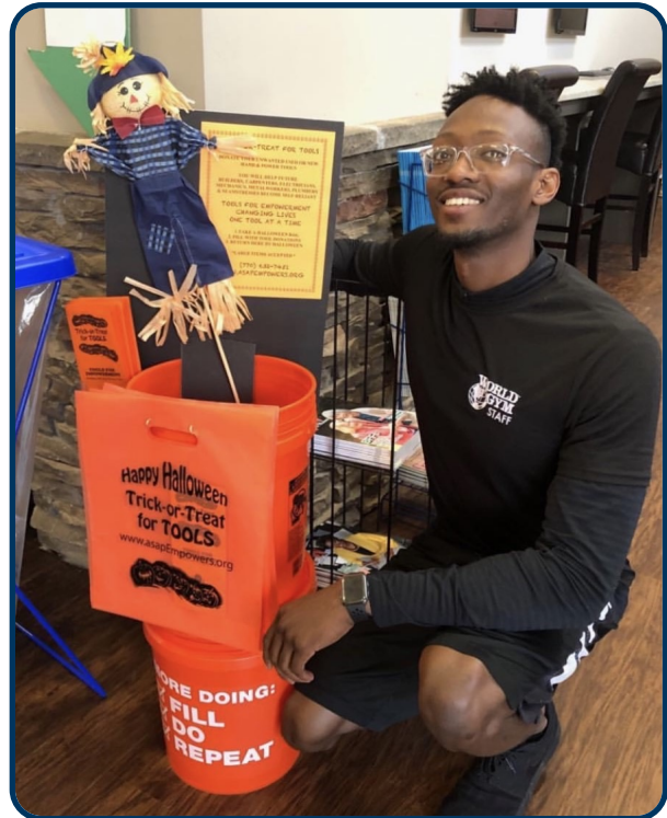
Thanks to World Gym and all the other businesses that participated in Trick-or-Treat for Tools

Many local churches, gyms, nurseries, auto shops, and retail stores hosted our displays for the Annual Trick or Treat for Tools drive. This event is our biggest tool drive of the year and also informs the community of our efforts locally and internationally. Volunteers assemble displays, reaching out to local businesses and organizations asking for their help in hosting a display for ASAP. We are thankful for the continued participation from both the business and patron sides!