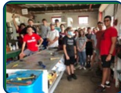
Volunteers from Foundry High School, where students learn hands-on skills. They get the job done!

The Foundry School adopted ASAP's workshop as their own this year. These brilliant and hardworking students restored not only tools but our headquarters as well! They were integral in starting our workshop garden and their excitement energized all of us.