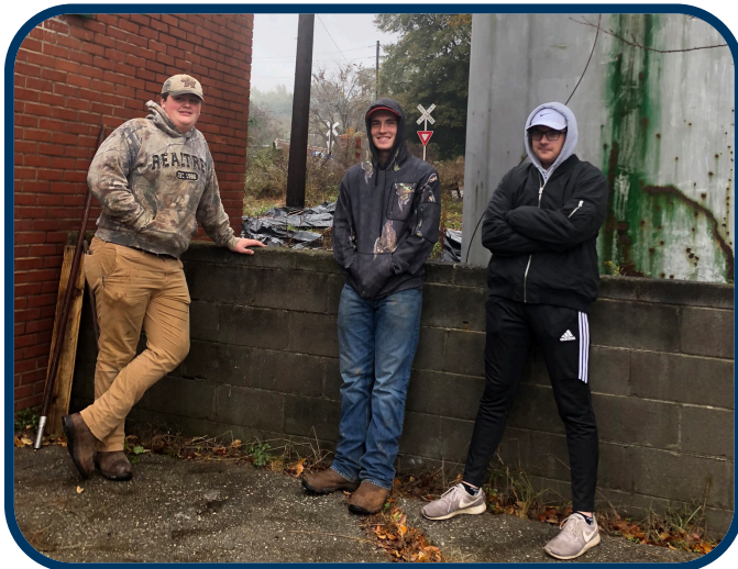
Innovative and industrious volunteers from Trinity Christian School bring much needed water closer to Tools For Empowerment

We would not exist without their diligence in donating time, energy, and equipment. Our volunteers are absolutely our lifeblood and we take every opportunity to praise their efforts. 2020 required a more creative approach to volunteering, so ASAP focused on small groups from the same organizations (i.e., schools, families, or churches) and many of our long-time supporters performed repairs and other tasks from the safety of their own homes.