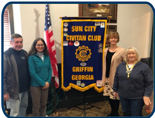
Sun City Civitan in Griffin held a drive-thru tool drive for Tools For Empowerment