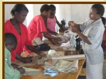
Adolescents require basic skills to earn a living.